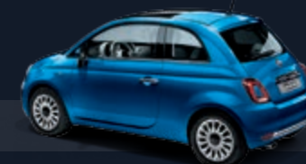
825 Blue Italy