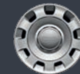
OR5 - 14" Grey hub cups (Cult)