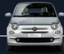
Bi-color White/Lunare Grey