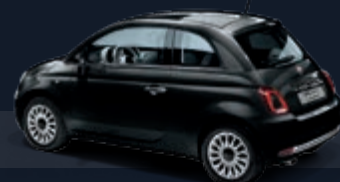
876 Vesuvio Black