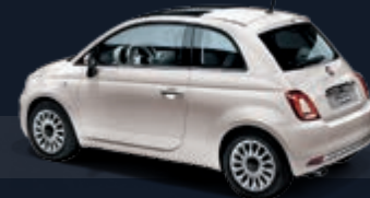
494 Powder Pink