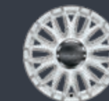
1M1 - 16" Alloy wheels white painted with diamond finish (only with Pack Dolcevita Plus)