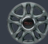
415 - 15" Alloy wheels Satin Graphite finish (opt. Connect)