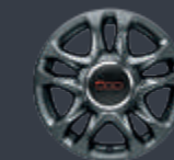
433 - 15" Alloy wheels glossy graphite finish (Connect)