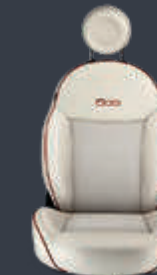
Ivory Frau leather with red piping (opt. Dolcevita)