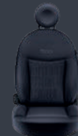
New blue fabric seats with Fiat monogram (Cult)