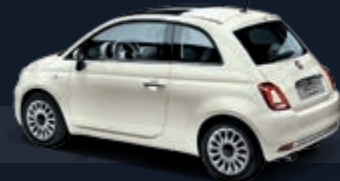
268 Gelato White