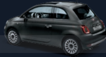
708 Cloud Matt Grey