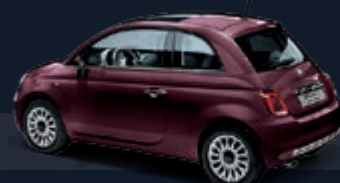
866 Opera Bordeaux