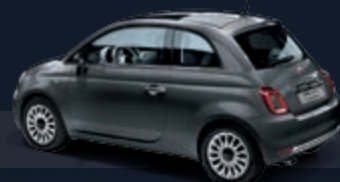
695 Grey Pompei