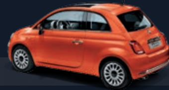
562 Sicilia Orange