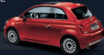
111 Passione Red