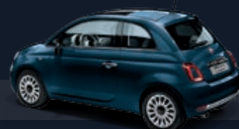
687 Blu dipinto di blu