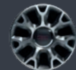
9S2 - 16" Alloy wheels diamond finish (Sport)