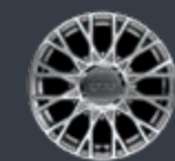
1LR - 16" Alloy wheel glossy silver (opt. Dolcevita)