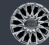
4AV - 15" Alloy wheels glossy silver (Dolcevita)