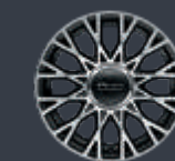
7PN - 16" Alloy wheels black painted with diamond finish (opt. Dolcevita)