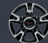
9S4 - 16" Alloy wheels Matt black painted with diamond finish (opt. Sport)