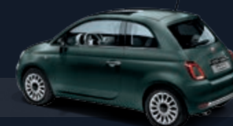
421 Portofino Matt Green