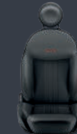
New black fabric seats "arrow" (Sport)