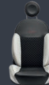
Black Matelassè fabric seats with soft touch details (Dolcevita)