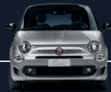
Bi-color Silver/Black roof