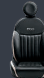
Black Frau leather with ivory colour leather inserts (opt. Dolcevita)