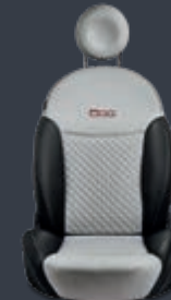
White sand Matelassè fabric seats with soft touch details (Dolcevita)