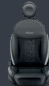
New "flashy" black fabric seats (Connect)